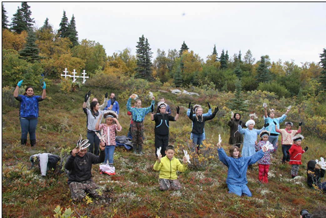
Blessing songs performed by the Igiugig Yup'ik dance group.