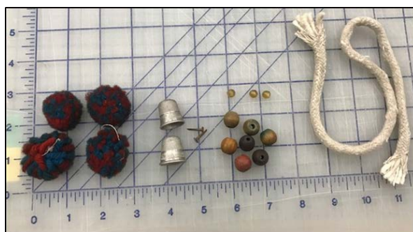
NMAI 253563.012 Dream Dance Drum fragments