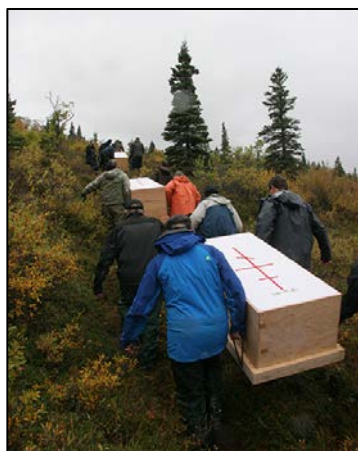
Igiugig community members and guests carrying ancestral remains to a former cemetery site.