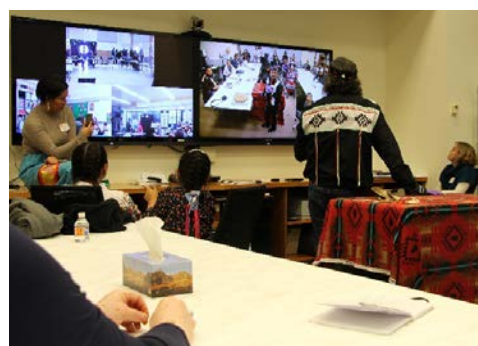
Alexis Nakota Sioux Nation tribal members consulting with community members on ceremonial and utilitarian objects from three remote sites.