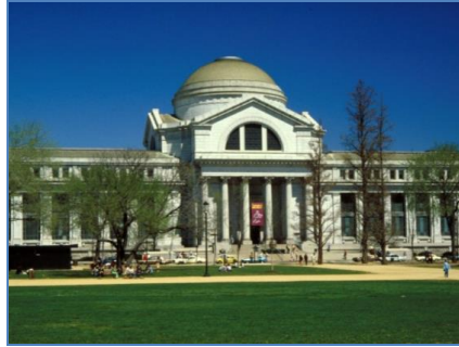
National Museum of Natural History