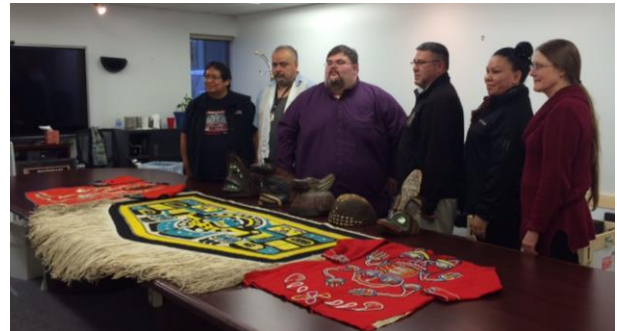
Respective members of the associated clans and Central Council staff preparing to ceremonially acknowledge their “At.óow,” and officially documenting their ancestors’ return for posterity.